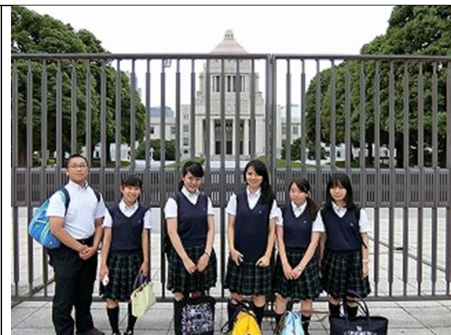
Front of the Houses of Parliament