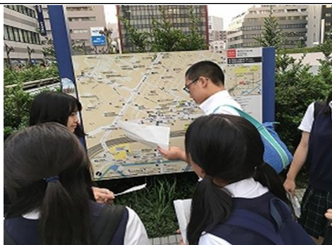
Rainbow Bridge→Tokyo Tower