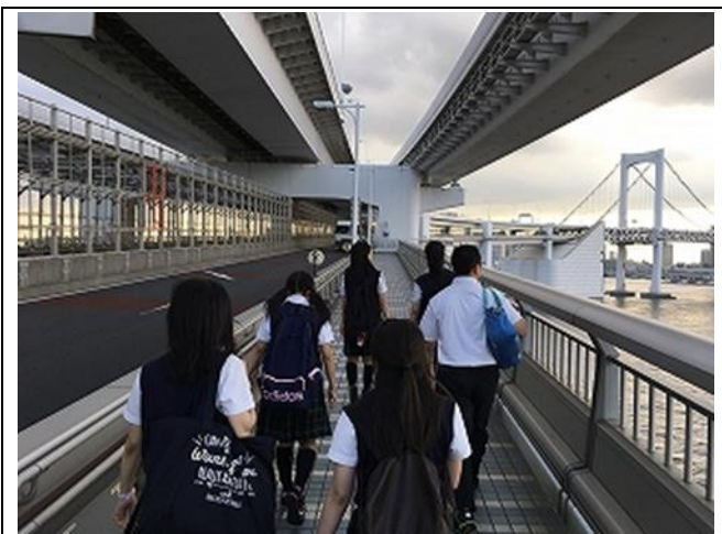
Tokyo Rinkai Disaster Prevention Park→Rainbow Bridge