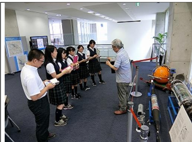
The University of Tokyo/Earthquake Research Institute