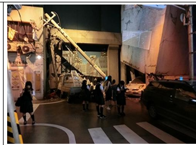
Sona Area Tokyo