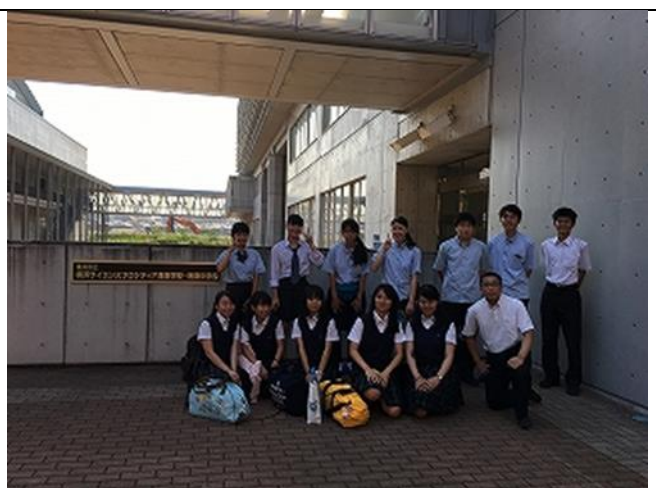
Exchange at Yokohama Science Frontier High School