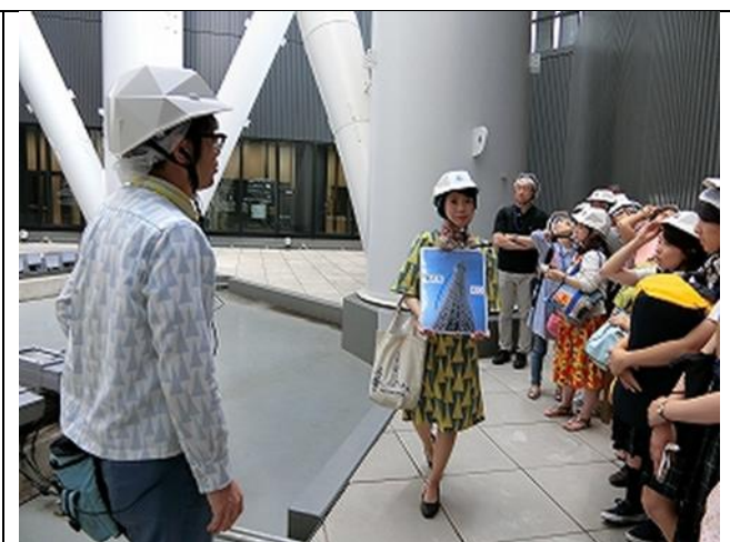
Visiting Tokyo SKY TREE