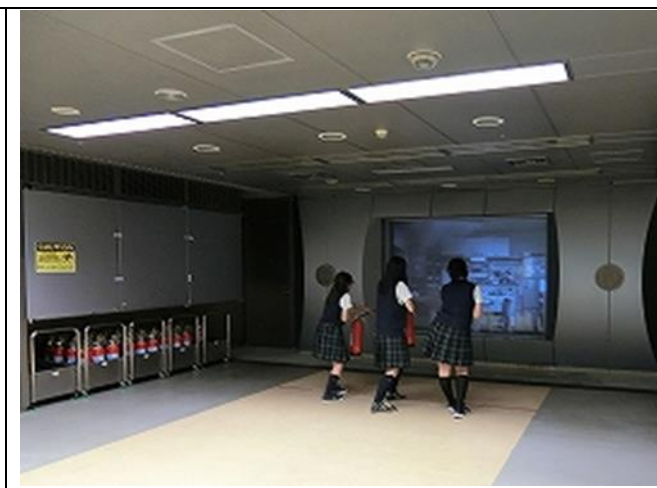
Tokyo Fire Department, Life Safety Learning Center