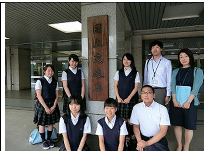
Ministry of Land, Infrastructure and Transport-1