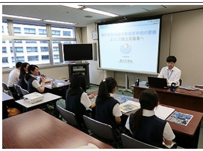
Ministry of Land, Infrastructure and Transport-2